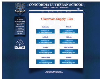
Link to an individual list

After you've loaded your lists, we'll email you the links (you can also get them by simply viewing your school or lists on TeacherLists.com). Adding your lists to your school website ensures parents always have access to your most current lists in a mobile-friendly format. Once your lists are active on TeacherLists, your lists will automatically update on your website, too – and you won't need your school webmaster to help. You can even choose how you'd like your lists to display. Learn more at www.teacherlists.com/how-it-works .