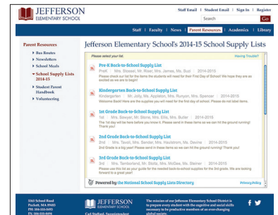
Display all your lists right within your website

Now that your school is plugged into the TeacherLists solution, it will be easier than ever to update and share your lists again next year. We're happy to act as your personal list assistant, too. Simply add us to your safe sender email list and we'll take of the rest. We'll send you links to your lists, notify you of cool new product features, and share special offers from our generous partners – from coupons and supply giveaways to big ticket sweepstakes. We'll even remind you when it's time to update your lists each year!