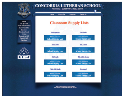
Link to an individual list

After you've loaded your lists, we'll email you the links (you can also get them by simply viewing your school or lists on TeacherLists.com). Adding your lists to your school website ensures parents always have access to your most current lists in a mobile-friendly format. Once your lists are active on TeacherLists, your lists will automatically update on your website, too – and you won't need your school webmaster to help. You can even choose how you'd like your lists to display. Learn more at www.teacherlists.com/how-it-works .