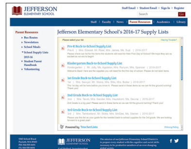
Display all your lists right within your website

Now that your school is plugged into the TeacherLists solution, it will be easier than ever to update and share your lists again next year. We're happy to act as your personal list assistant, too. Simply add us to your safe sender email list and we'll take of the rest. We'll send you links to your lists, notify you of cool new product features, and share special offers from our generous partners – from coupons and supply giveaways to big ticket sweepstakes. We'll even remind you when it's time to update your lists each year!