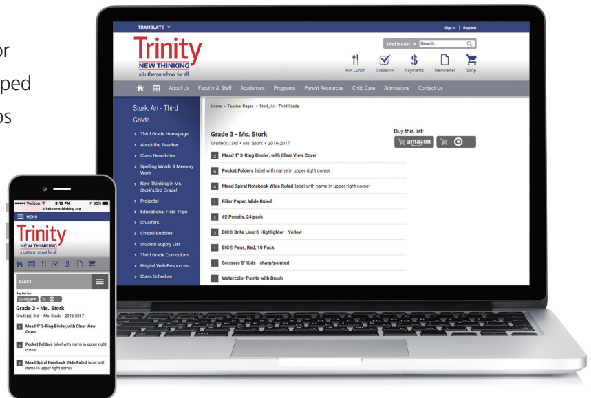
BlackBoard Web Community Manager

The process of sharing lists is made easier than ever with the School Supply List custom app for Blackboard Web Community Manager. Developed in collaboration with TeacherLists, the app helps make it easier to upload, publish and share school supply lists with parents. And, now BlackBoard Mobile Communications App has a direct link to those lists as well, making it easier than ever for parents to find, view and shop their back-to-school supply lists as soon as they are available.